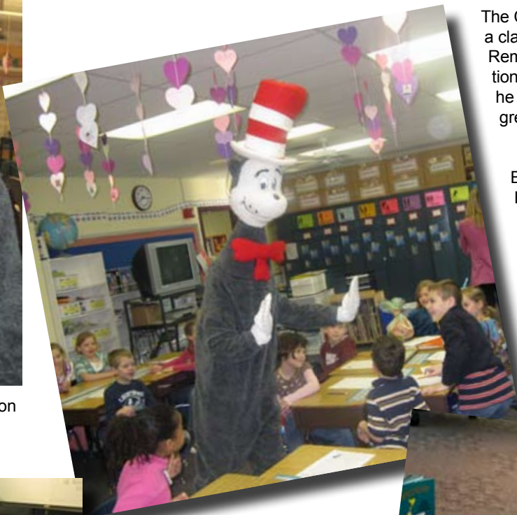
The Cat visits a classroom at Remington Traditional School where he received a warm greeting.

The Cat in the Hat was making the rounds in Pattonville recently - if not in person, then in spirit. The focus on the famous Cat at elementary schools in Pattonville last week was part of Read Across America, a nationwide campaign that emphasizes reading. Sponsored by the National Education Association, "Read Across America" marks Dr. Seuss' birthday and encourages children and adults to read together. Schools enjoyed visits from the Cat in the Hat, held reading sessions in pajamas, sponsored Family Reading Nights and other reading activities to build excitement for reading. The Cat was chaperoned by student volunteers from Pattonville High School.